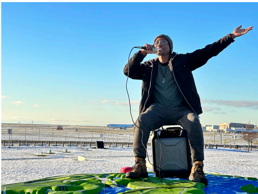
The hip-hop songwriter brings positive energy and his